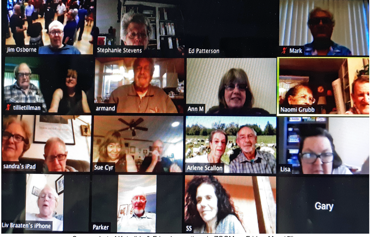
Screen shot of Katydids & Friends meeting via ZOOM on Friday, May 15th.